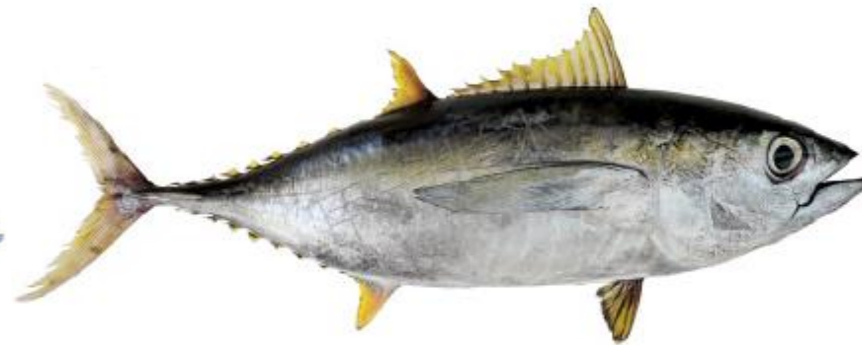
Skipjack/ Bonito Katsuwonus pelamis

PRESENTATION : IVP, IWP SECONDARY PACKAGE : BULK PACK 30 Lbs, IVP 10 Lbs SIZE: • LOINS 3 – 5 / 5 – 8 / 8 – 12 Lbs, • STEAK 4 / 6 / 8 Oz, • SAKU AA / AAA, • CUBES AA / AAA • CANNED: 80gr, 140 gr, 170 gr.